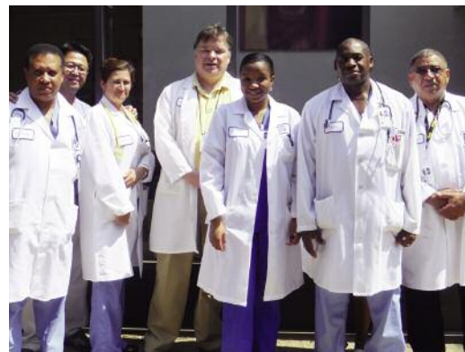
Some of the Respiratory Care staff

These health care specialists evaluate, treat and care for patients with cardiopulmonary (heart-lung)